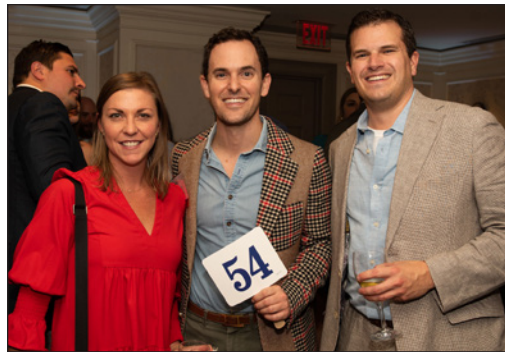
2023 FCBA Charity Auction

Pre-registration is now LIVE! Visit the Auction Website to create your account for bidding in the online auction through the Greater Giving